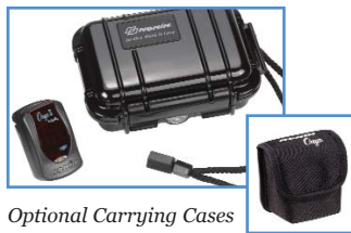
Optional Carrying Cases

Please contact your authorized distributor for more information.