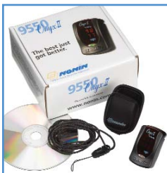
Standard Package Items